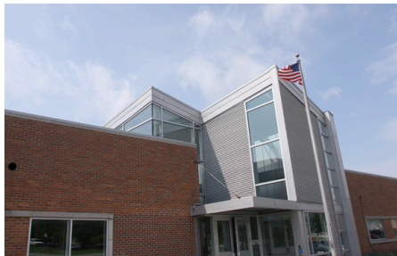
TECH COLUMBUS ON KINNEAR RD.