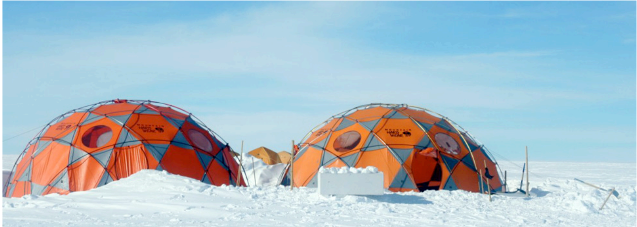
BYRD POLAR RESEARCH CAMP.